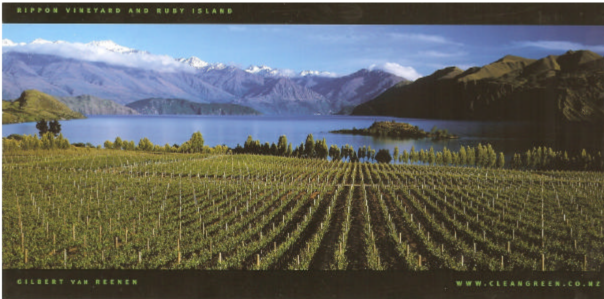
RIPPON VINEYARD AND RUBY ISLAND