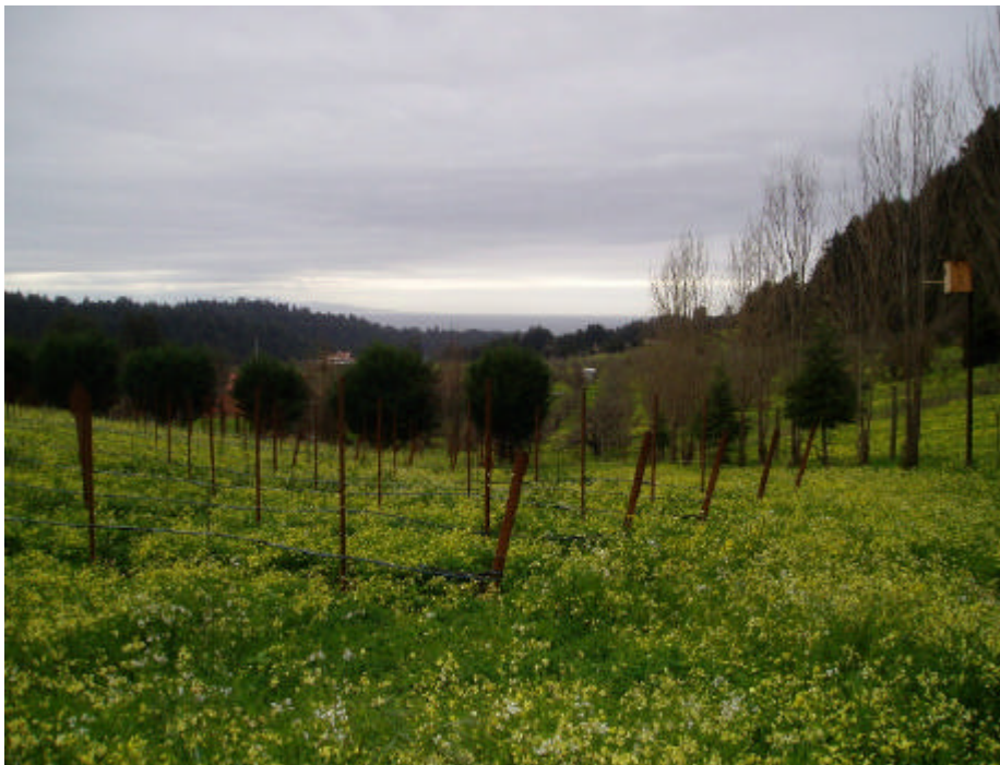
View of Pacific Ocean from Soquel Vineyards estate vineyard

The Pinot Noirs from the Santa Cruz Mountains reflect the unique terroir here. The distinctive, rocky, well-drained soils add an appealing minerality. The extended growing season creates grapes with complex and intense flavors and bright acidity. The grapes ripen in cool temperatures as the daily fog rolls in sometime in the late afternoon or early evening with the sun burning it off the next morning. The result is Pinot Noir in its purest expression: lovely aromatics, luscious red fruit flavors, soft tannins, all packaged in a light to medium bodied wine so juicy you can 'nibble' at it