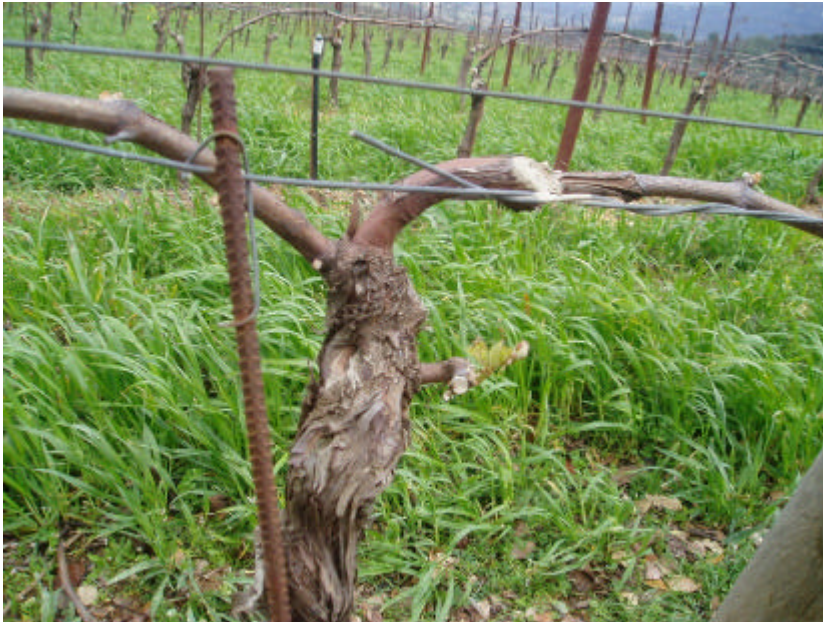
First leaf, early March, old Pinot Noir vine at Mount Eden