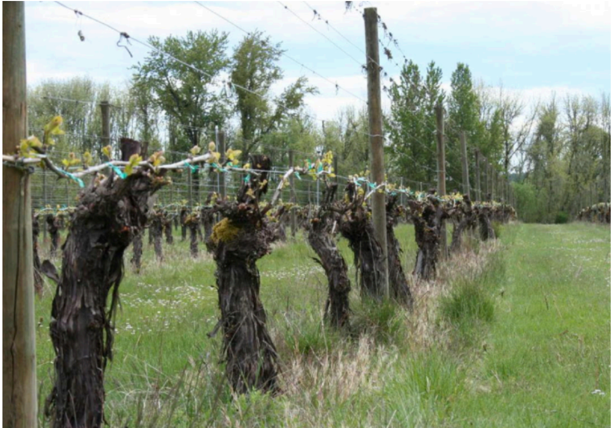
Tyee Estate Vineyard Old Pommard Vines

amount of organic spray is applied to the vines and organic compost is used for fertility. A diverse, perennial cover crop under the vines sequesters carbon and prevents erosion. The vineyard is Certified Salmon-Safe.