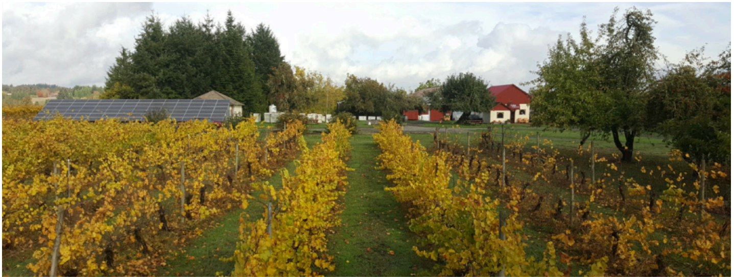
Tyee Estate Vineyard and Winery

The winery's tasting room is located in the historic former milking parlor used by third-generation Buchanans who raised Jersey cows on the Century Farm. Tasting is available from 12:00 pm to 5:00 pm April through December ($10). Current production is between 1,500 and 2000 cases annually. The photo below shows the Tyee Estate Vineyard solar panels that power the winery and the red-roofed tasting room and winery.