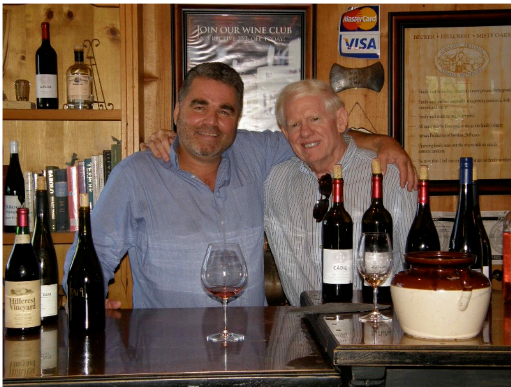
HillCrest Winery, "The Birthplace of Oregon Pinot Noir" 2012

Pinot Noir is the most sensually indulgent wine of all.