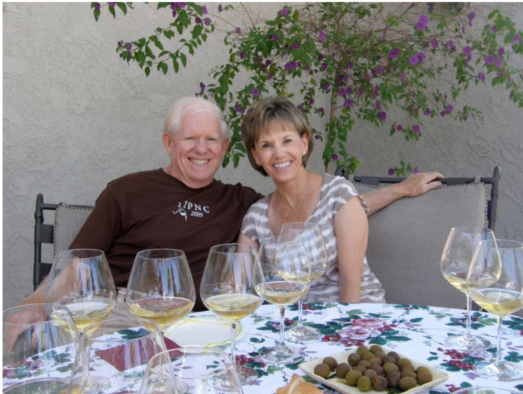
Behind every Prince is a Princess

Picking a Pinot Noir is like starting a romance - the success rate is not high.