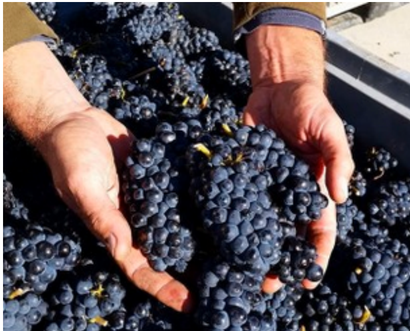
Pinot Noir clusters

The English wine writer Jancis Robinson calls Pinot Noir "that minx of a grape." Well-known Australian wine writer James Halliday has accused Pinot Noir of being "a temperamental and fickle mistress. Wine writer Bob Thompson once said of Pinot Noir, "Even where it prospers, it needs to be coaxed, wheedled, flattered, cajoled cursed, and prayed over almost ounce by ounce through a series of crises that start at the fermenters and last beyond bottling." Wine writer Frank Prial said, "Even the Burgundians, who have been working with it for centuries, have trouble growing Pinot Noir and more trouble making it into wine."