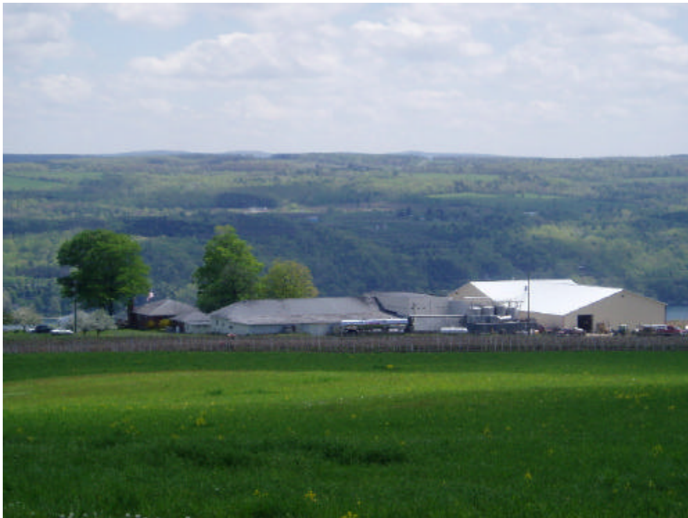
The Dr. Konstantin Frank Winery