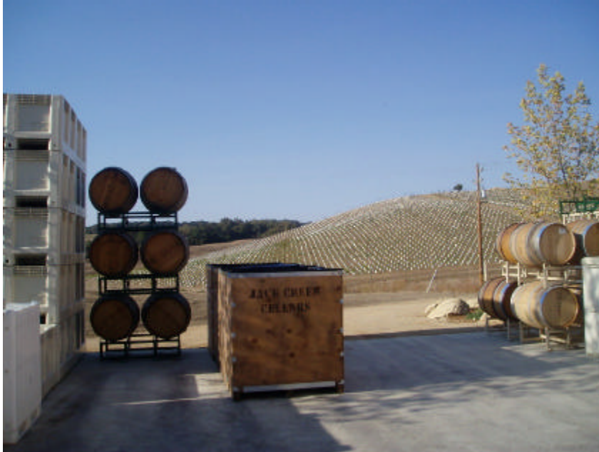
The photo shows the new plantings from the winery's pad.

The layout at Jack Creek Cellars and the Kruse Vineyard is dreamy. The gorgeous home sits on the top of the hill surrounded by vineyards and the modern winery and adjacent storage barn is tastefully positioned among the vineyards as well. Inside the winery, Doug has a comfy couch and a large TV (tuned to an NFL game on the day we visited).