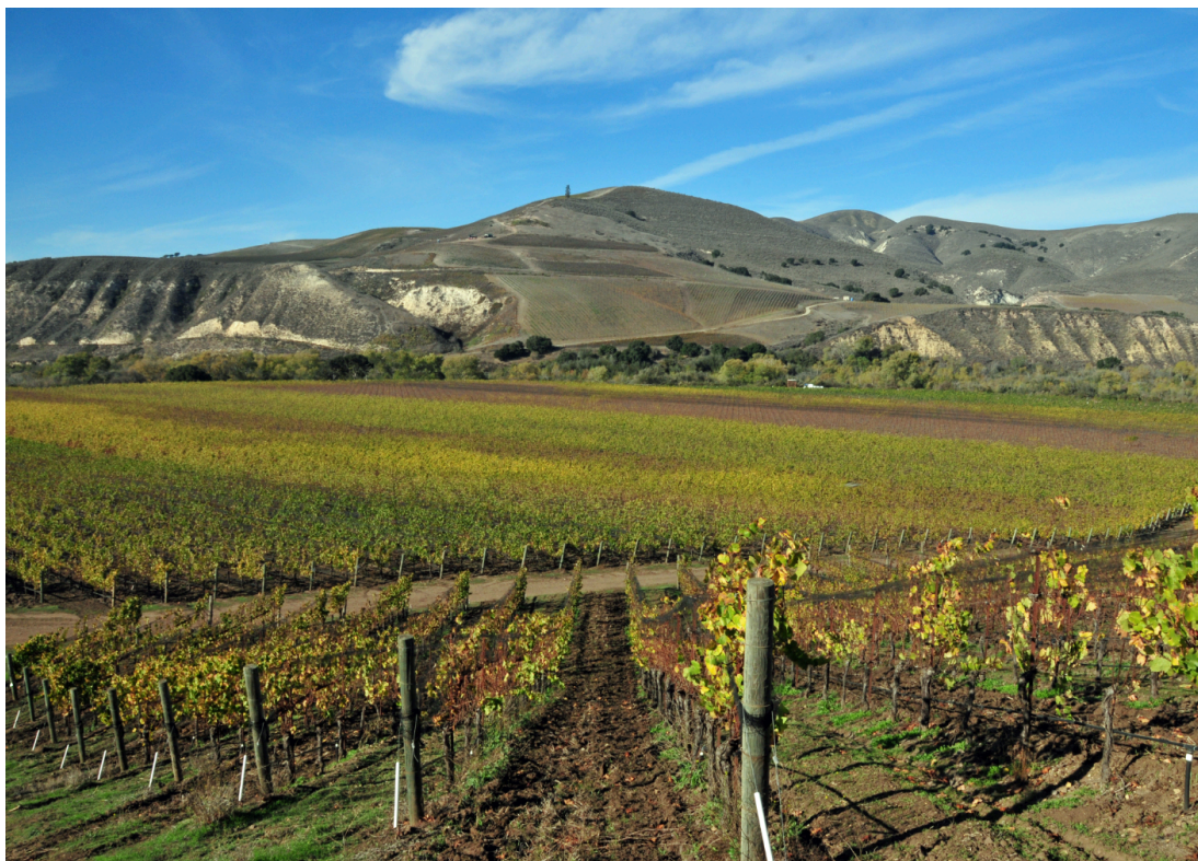
Fiddlestix Vineyard, Sta. Rita Hills

2014 Etude Fiddlestix Vineyard Sta. Rita Hills Pinot Noir $45. Vineyard is located about 10 miles inland from the Pacific Ocean alongside the Santa Ynez River bench at the western end of the Santa Ynez Valley. 35 small blocks with a variety of rootstocks and clones planted in well-draining clay loam and calcareous marine shale. Clones 667, 777, 113, Pommard 4 and 5. Light cherry red color in the glass. Engaging perfume of fresh crushed cherries, savory spices and rose petal. Very silky and elegant, with sportive mid weight flavors of ripe strawberry and black cherry fruits with a welcome touch of spice. The tannins are noticeably refined, something of note since the tannins can be aggressive in wines from this vineyard. Just a touch of oak seasoning is complimentary. A brilliant offering, with a finish that goes on and on. The winemaker's extensive experience with the fruit from this vineyard shows in the excellence of this wine. A superb value too boot. 94.