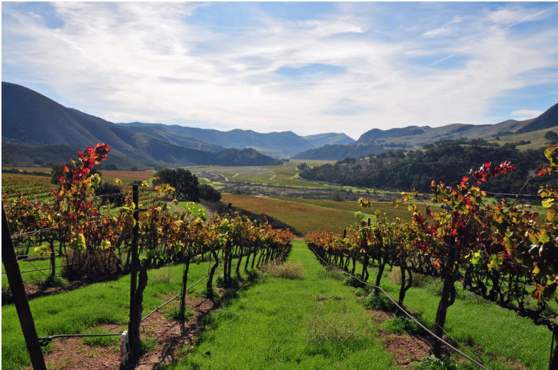
North Canyon Vineyard, Santa Maria Valley

2014 Etude North Canyon Vineyard Santa Maria Valley Pinot Noir 14.4% alc., $45. This vineyard sits along the Santa Maria River bench in a secluded canyon. A variety of clones and rootstocks are planted in calcareous clay sandstone, differing from the valley's defining marine mixture of ancient sea bed, clay loam and sand. This wine is made from a select block located on a bluff in the southern, cooler end of the canyon. Dijon 115, 667, 777 and 113. Moderately light reddish purple color in the glass. Love the nose that brings an array of aromas including dark fruits, brier, baking spices, tobacco and turned earth. Beautifully composed and easy going, with very tasty purple and black fruits and an earthen underbelly. The tannins are well integrated and there is recognizable length on the pleasing finish. Primarily a fruit-driven wine, but so harmonious that it will grab your attention. 93.