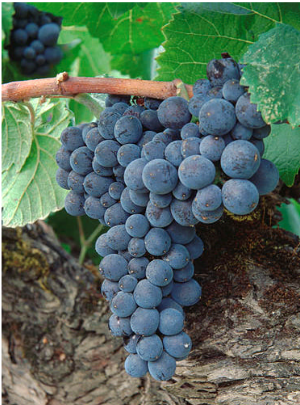
A photograph of a cluster of Rochioli West Block Pinot Noir photographed by Bobbi Chamberlain in 2003 (Copies are available from the photographer for purchase - contact me for details)