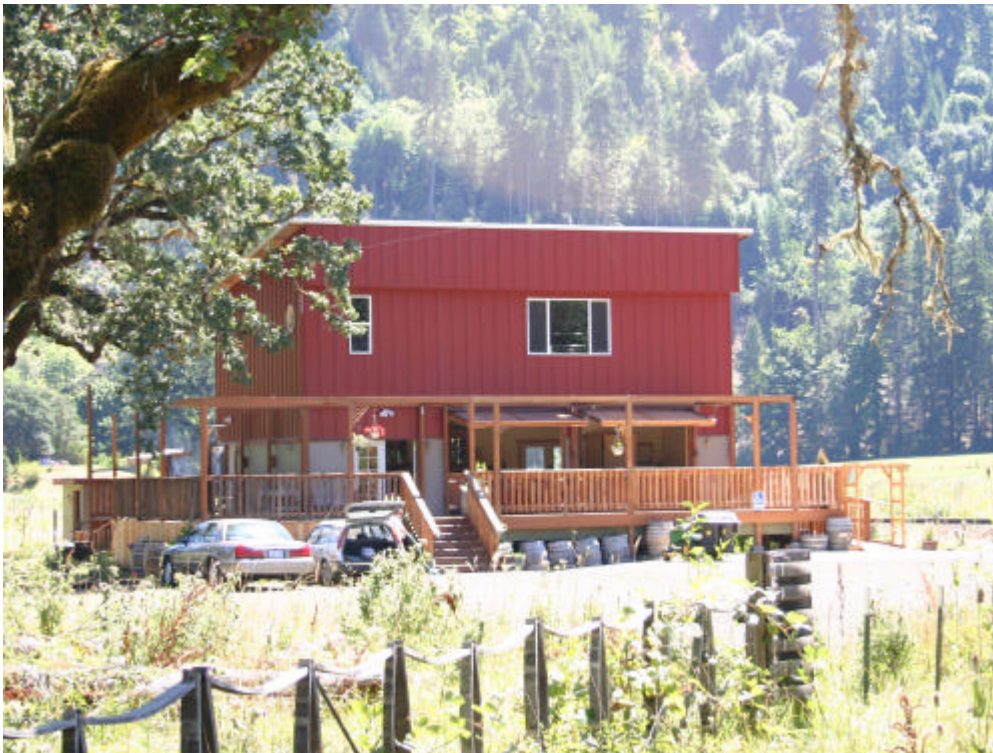
Harris Bridge Winery, site of the Club Noir tasting.