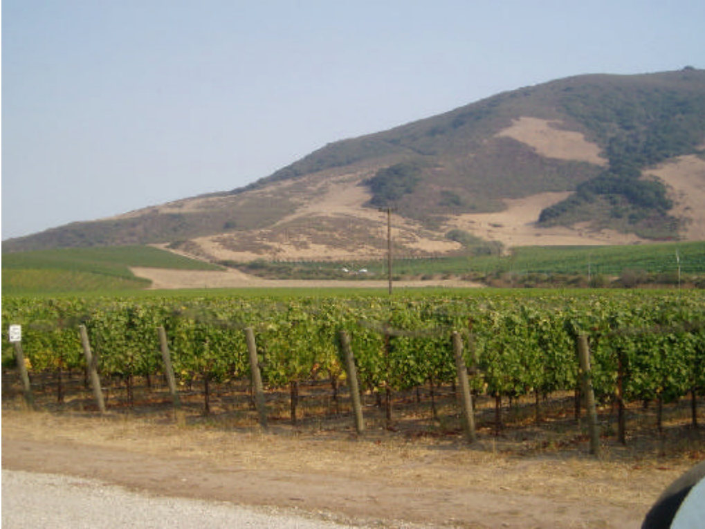
Above is the view of the vineyard toward the south with the Sanford & Benedict Vineyard in the distance. Hillside plantings at Fiddlestox are seen to the left. Below is the view from the hillside vines looking north toward the Sea Smoke vineyards on the distant hillside.