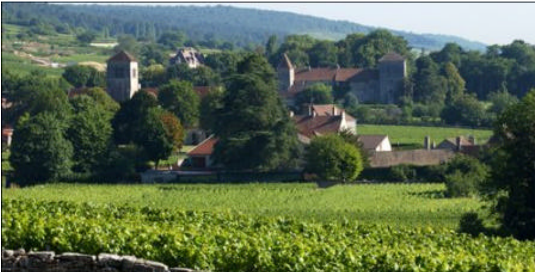
Village of Vosne-Romanee